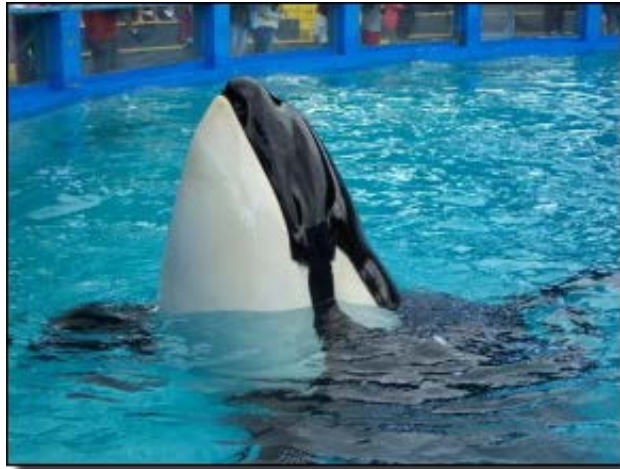
Lolita in the 80' long x 35' wide x 20' deep tank in Miami.