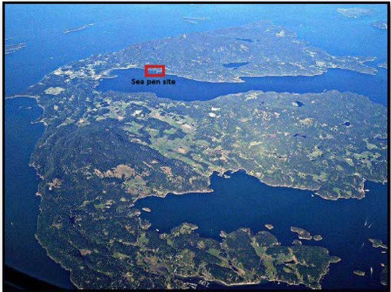
Lolita's seapen site in the San Juan Islands.