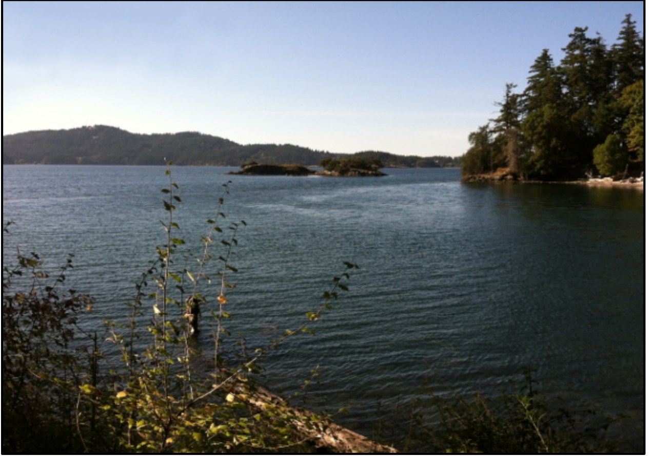
Tokitae's Retirement Center – East Sound, WA