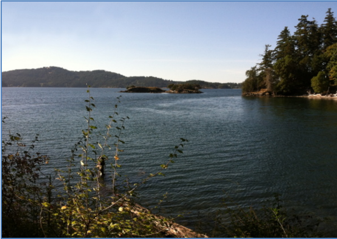
Seapen site in the San Juan Islands.